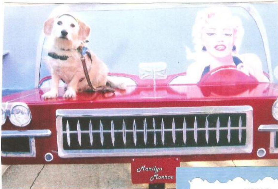
Two Divas! Cookie sits on an artist painted bench at Oktoberfest this past year