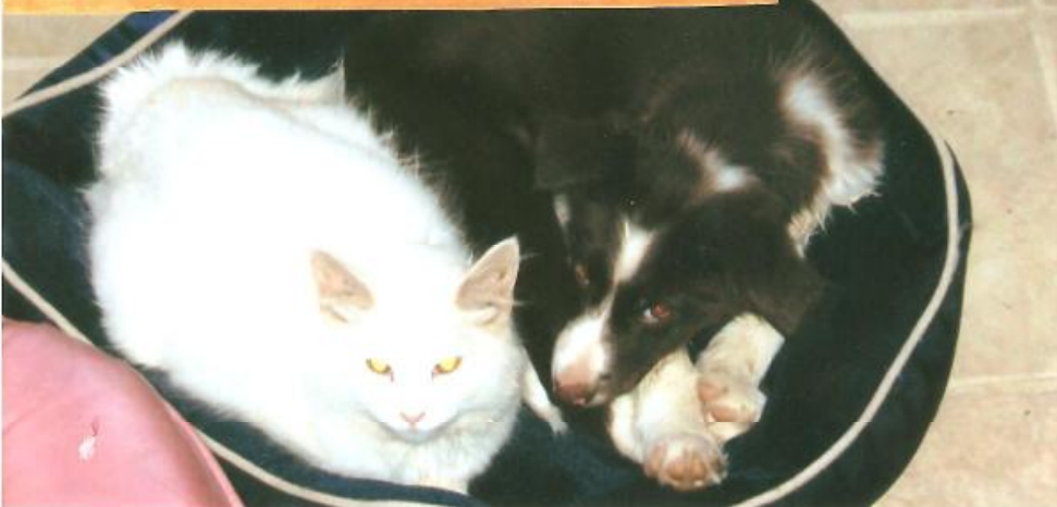
Who says dogs & cats don't get along? Winter (the cat) and Bella share creature comforts!